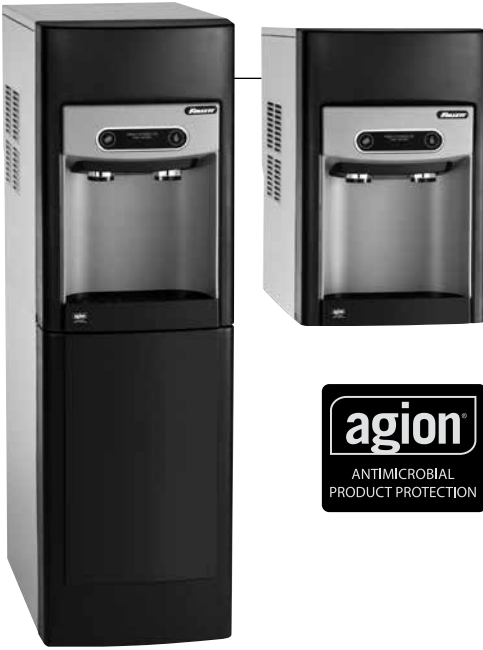
Shown with optional base stand

NOTE: For use in applications with greater than 5 mg/l but less than 400 mg/l total dissolved solids in water and less than 200 mg/l hardness (either naturally occurring or treated with reverse osmosis or other TDS reducing technology). Not recommended for use with softened water.