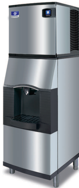
Indigo NXT iT0620 Ice Machine SPA-160 Ice Dispenser

With Indigo and Indigo NXT ice machines you can program the ice machines to be off certain hours of the day so that while the hotel guests are sleeping, the ice machine can be too!