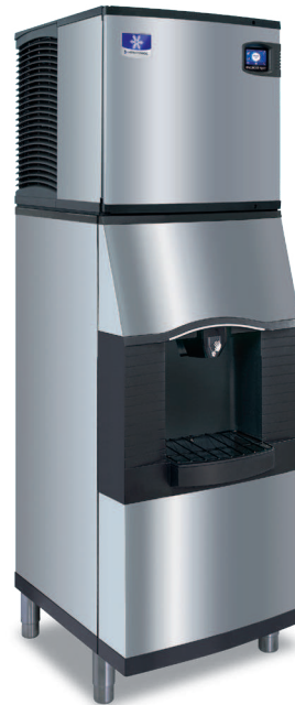
Indigo NXT iT0620 Ice Machine SFA-191 Ice & Water Dispenser